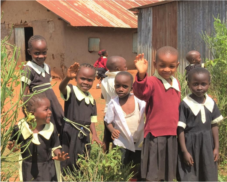
NEIGHBORHOOD PRIMARY SCHOOL KIDS