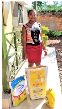
Getting food to take back home!