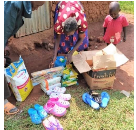
It's so much more than just food

Thank you for being the reason others can "jump for joy" on the other side of the world!