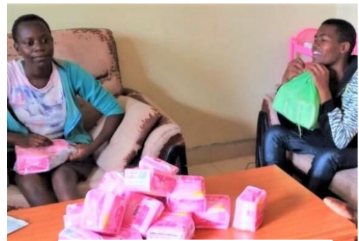
Pick-up Day for the Girls

It is Amazing the difference you make in a girl's life with your support!